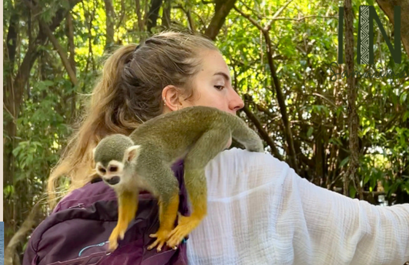
Meet the local Wildlife