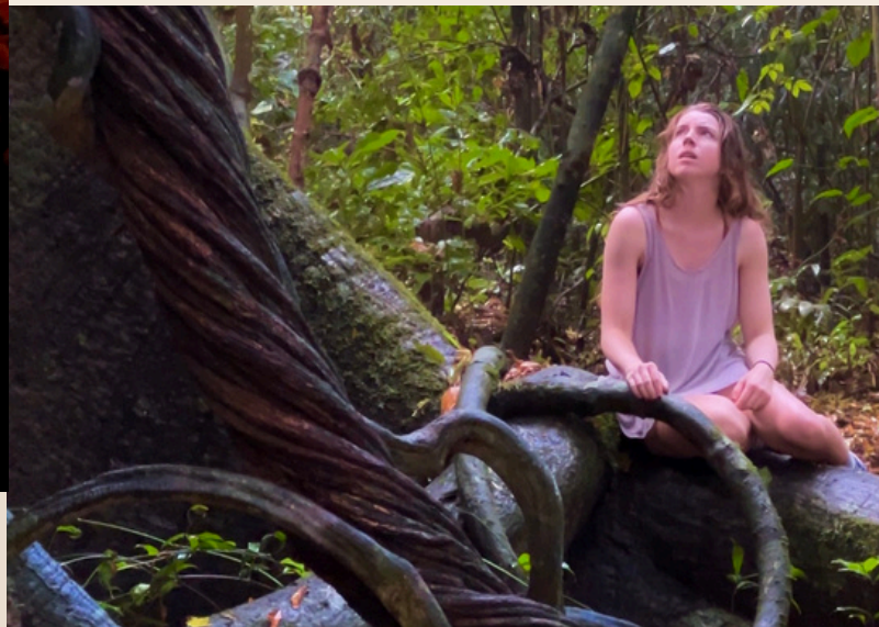
11-miles trail to meet the grandmother kapok tree followed by a night in the forest