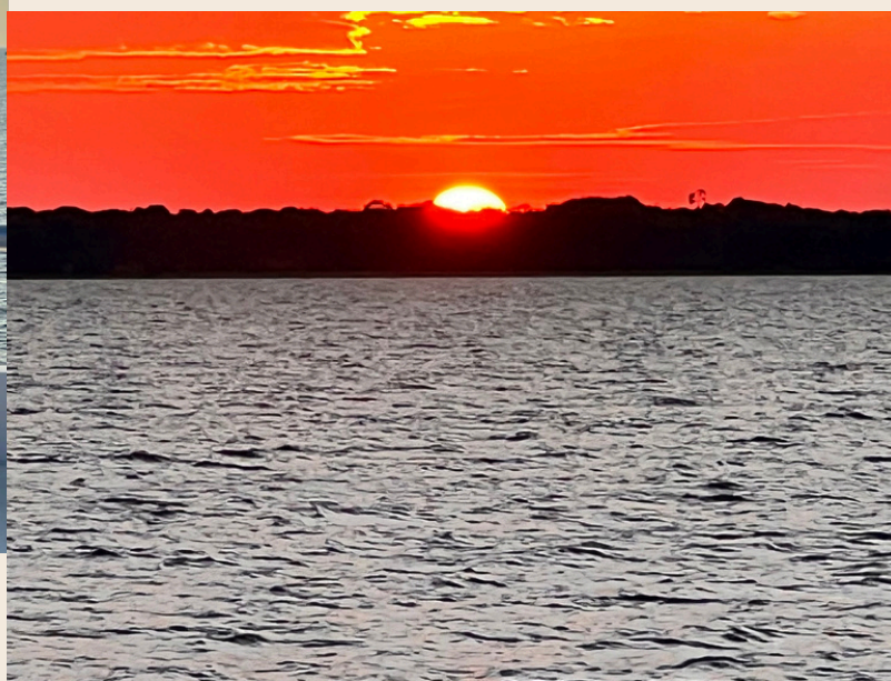
Witness Unforgettable Sunsets and Sunrises