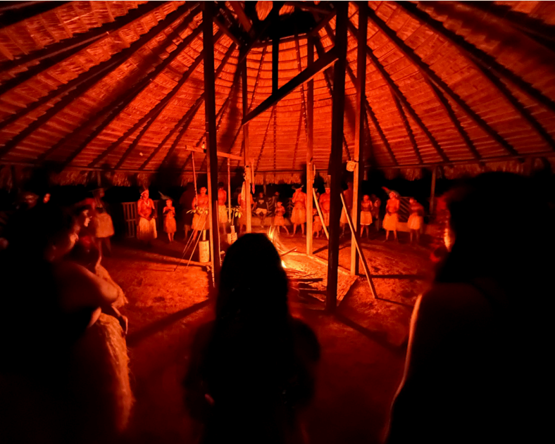
Sacred ceremonies with indigenous communities