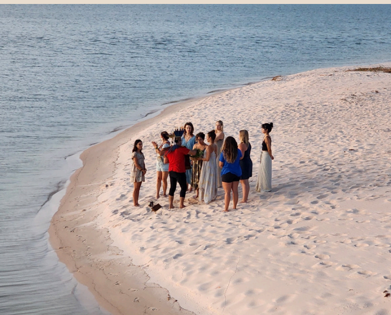
Work on Yourself While in Paradise