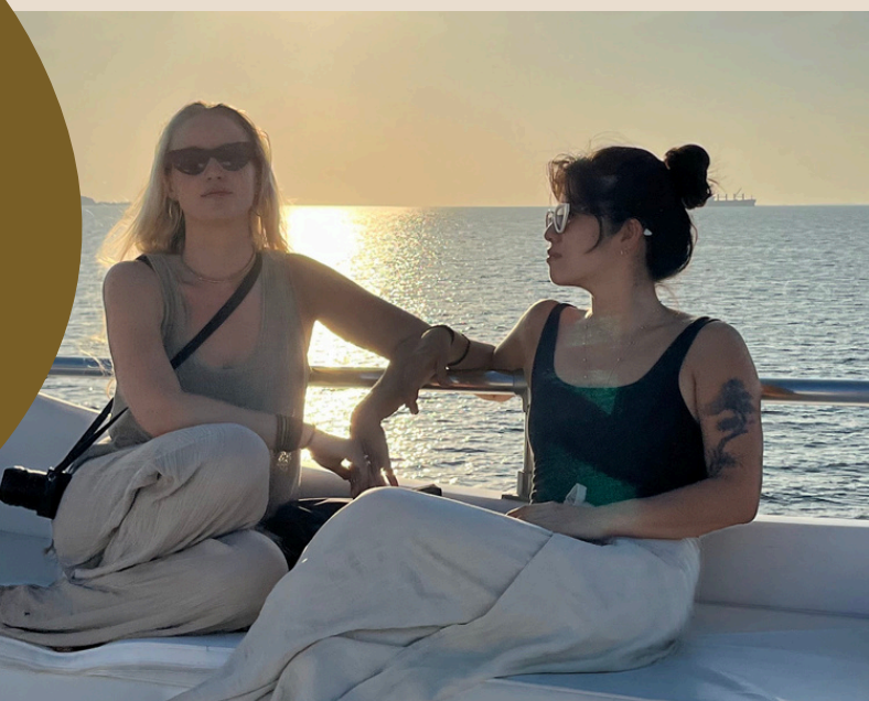
Spend Time navigating the Last Protected Portal in the Rainforest