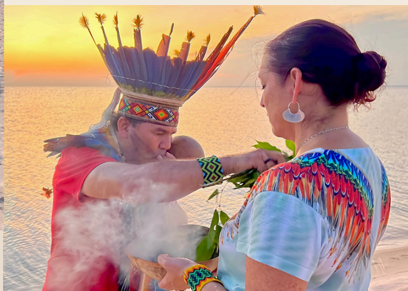
Get Shamanic Blessings