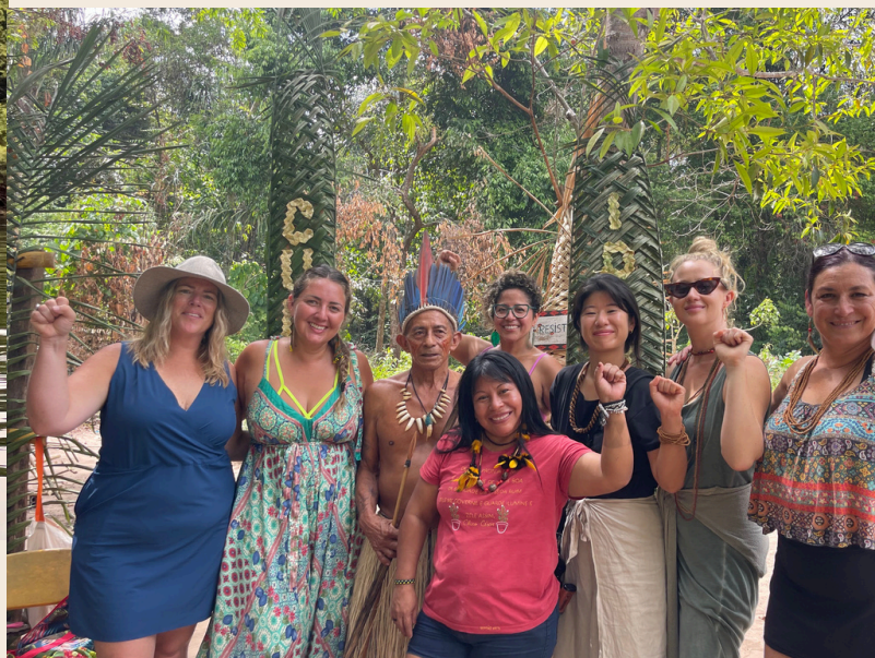
Meet local indigenous leaders and their struggles