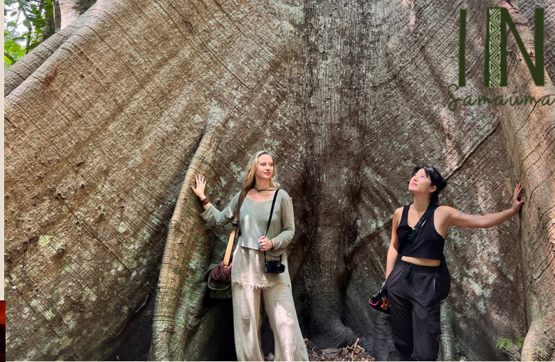
5-miles trail to meet the baby kapok tree