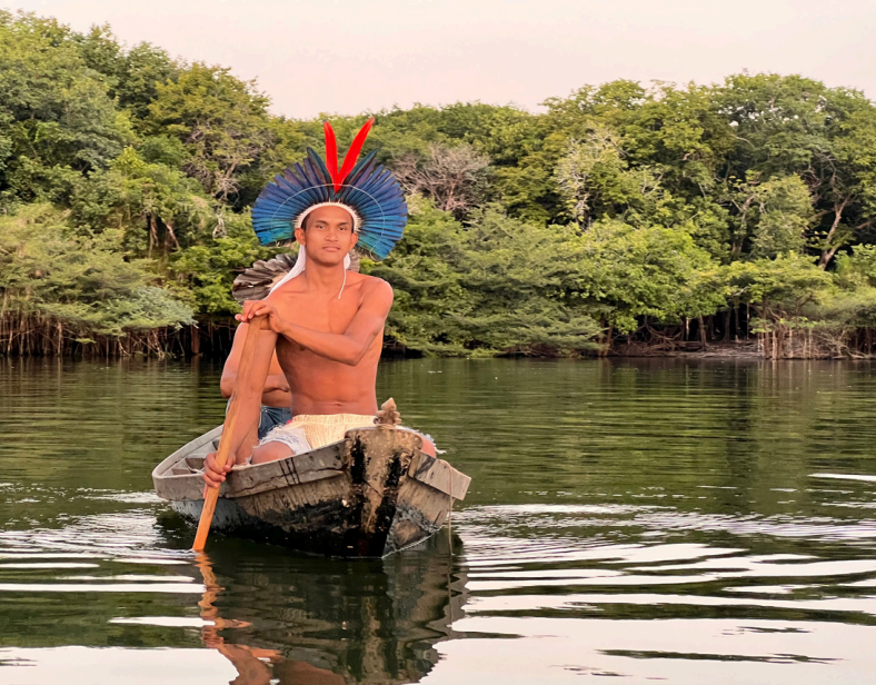
Spend time with traditional indigenous communities